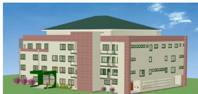
Proposed Multi-purpose Building

Also, the government agency, the National Accreditation Board will not permit us to continue to enroll in view of our inadequate facilities.