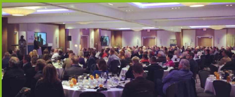
President speaking at Orange County

He met with over 400 individuals from different groups. It is our prayer that these meetings will yield future partners and visionaries who can