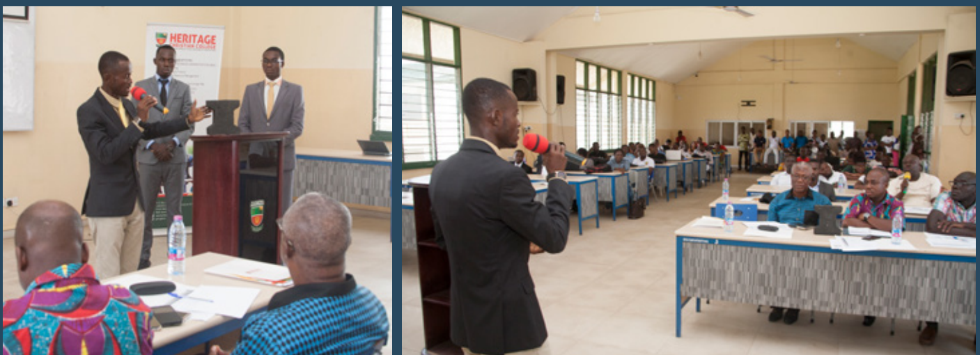
Team Plastic-Blocks pitches at Finals