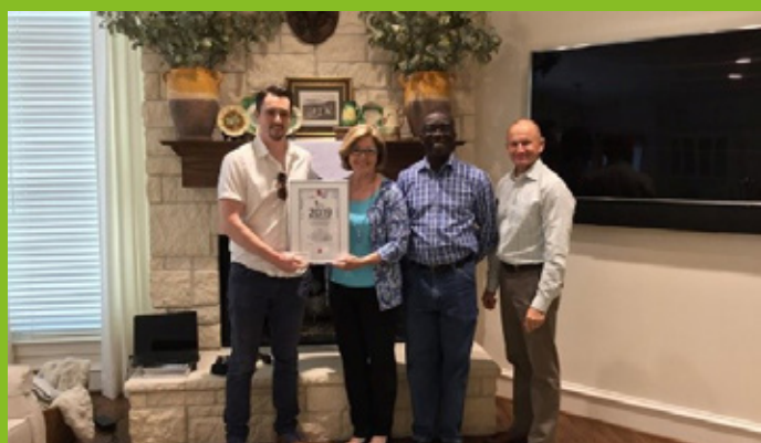
HCC video documentary wins Webby Award