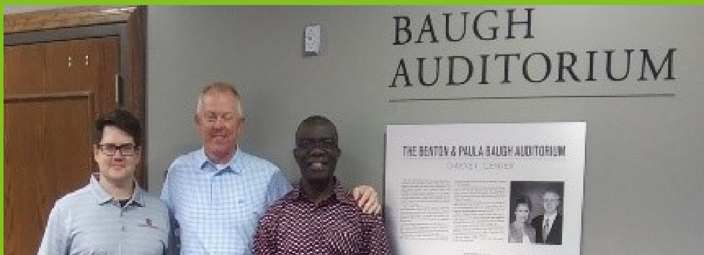
President at Oklahoma Christian University