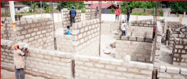
Ongoing construction works on Media Centre