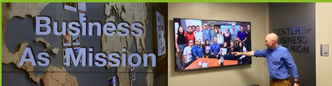
Center for Business As Mission at Lipscomb University