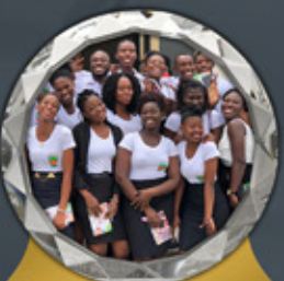
BEST ENTERTAINING GROUP HCC VOCAL CHORDS