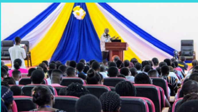
HCC President addresses the students