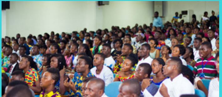
Students at the Conference