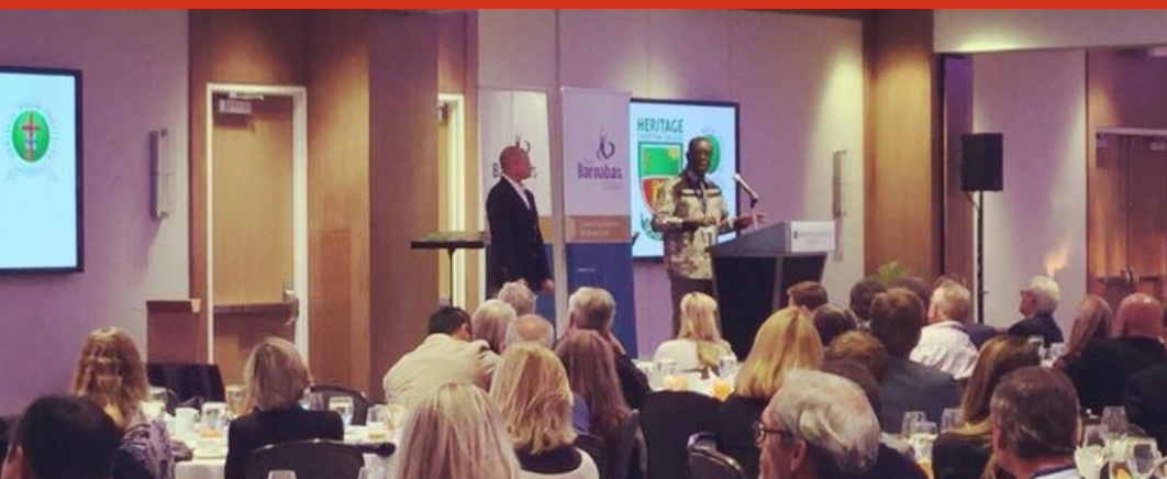
President speaking at Orange County