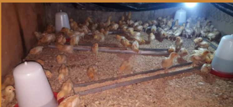
Chicks at various stages of growth