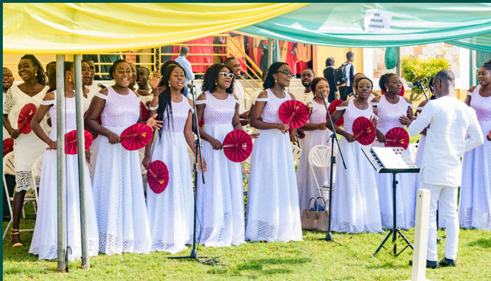
His Praise Chorale