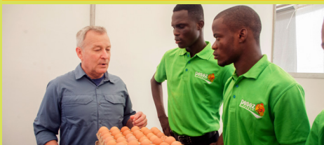
Peszez Farms (poultry farming)