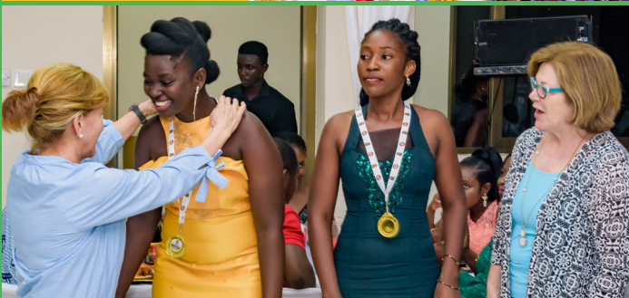
Student Entrepreneurs receiving medals