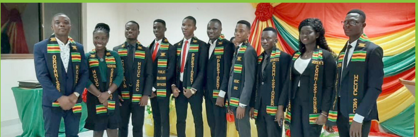
Newly inducted SRC Leaders