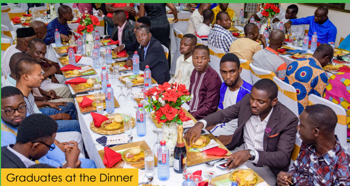
Graduates at the Dinner

A dinner was held for graduates of HCC and HBI on 13th December, 2019. Guests from US got the chance to interact with the students and share ideas during the dinner.