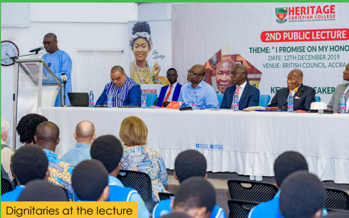
Dignitaries at the lecture