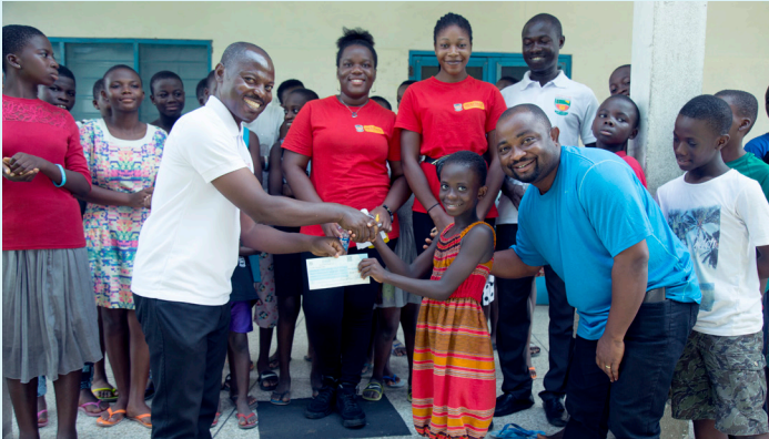
Donation at Village of Hope

On 7th December, 2019, HCC donated GHc10,000 apiece to the Village of Hope Children's Home and Shekinah Clinic for the Poor and Destitute in Tamale. The donations were voluntary contributions mobilised from students and staff to express one of the core values of HCC: Philanthropy.