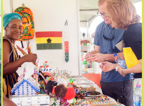
HCC student business