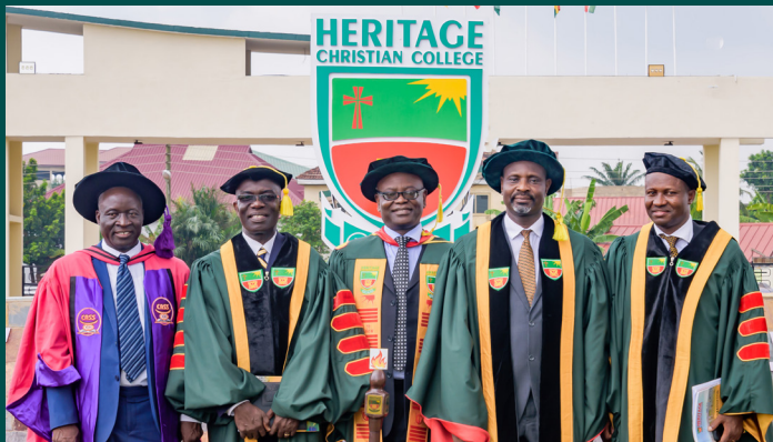
Principal Officers of HCC with Rep. of KNUST Vice-Chancellor