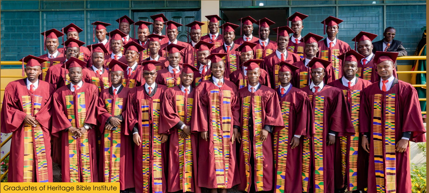
Graduates of Heritage Bible Institute

The 19th Commissioning Ceremony of Heritage Bible Institute was held on 14th December. Thirty-seven (37) gospel ministers and church leaders graduated with Certificates in Intermediate in Christian Ministry.