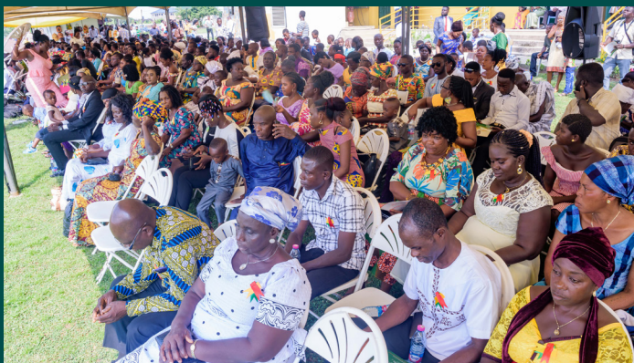
Guests at the graduation