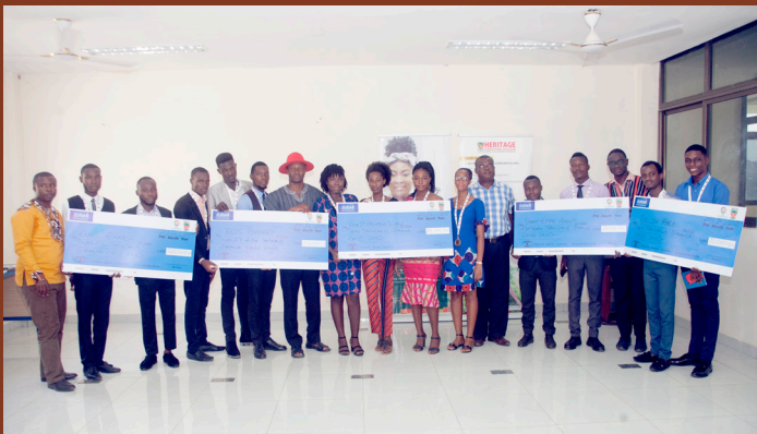
Newly awarded Student Entrepreneurs