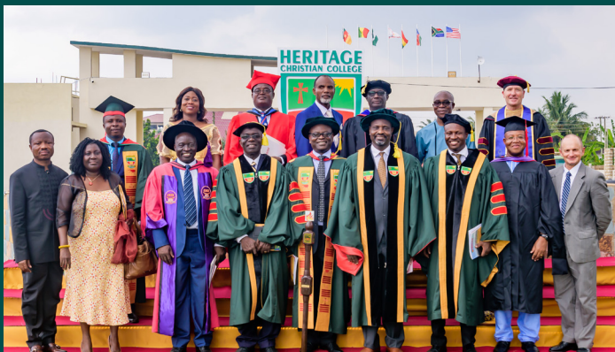
HCC Principal Officers with some dignitaries at the graduation