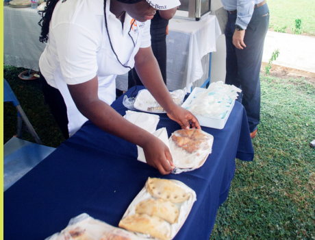
Promptopacs (Catering service)