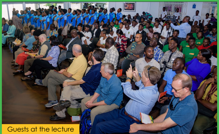
Guests at the lecture