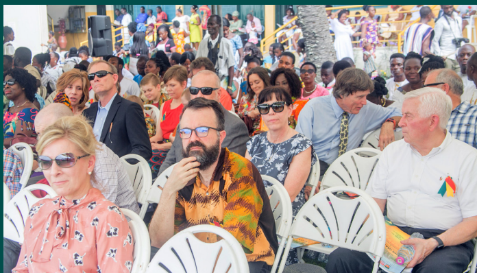
Guests from US