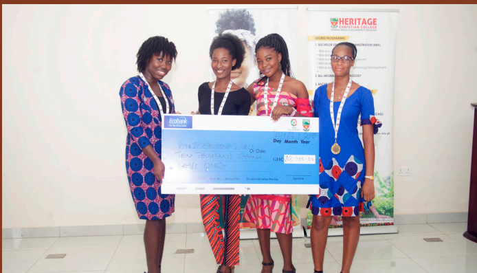
RM & JP Grooming World