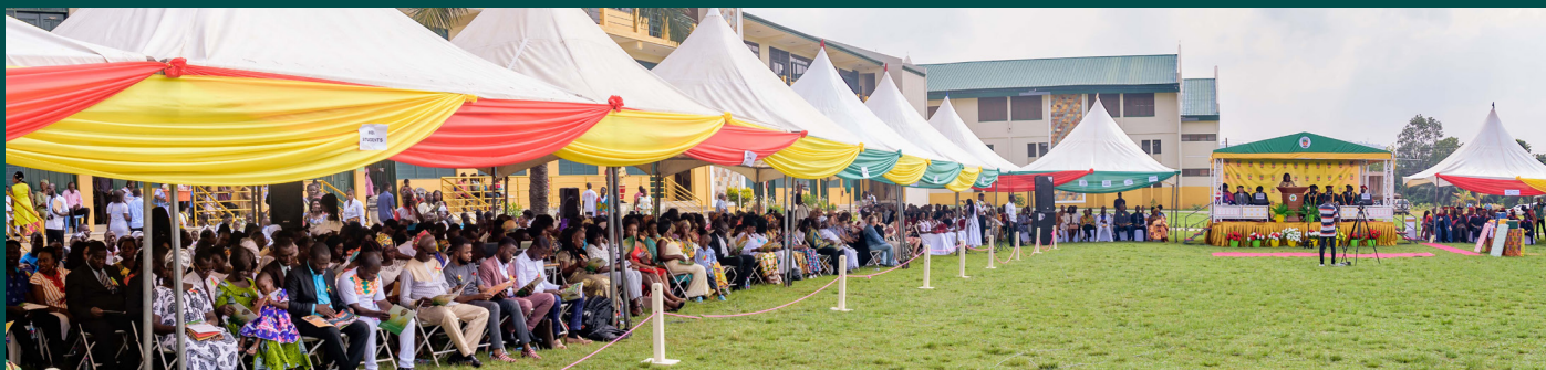
Cross-section of the graduation ceremony