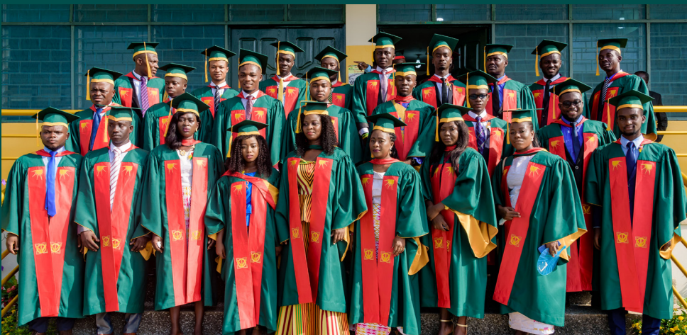
Graduates of Heritage Christian College