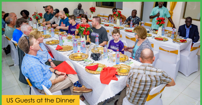
US Guests at the Dinner