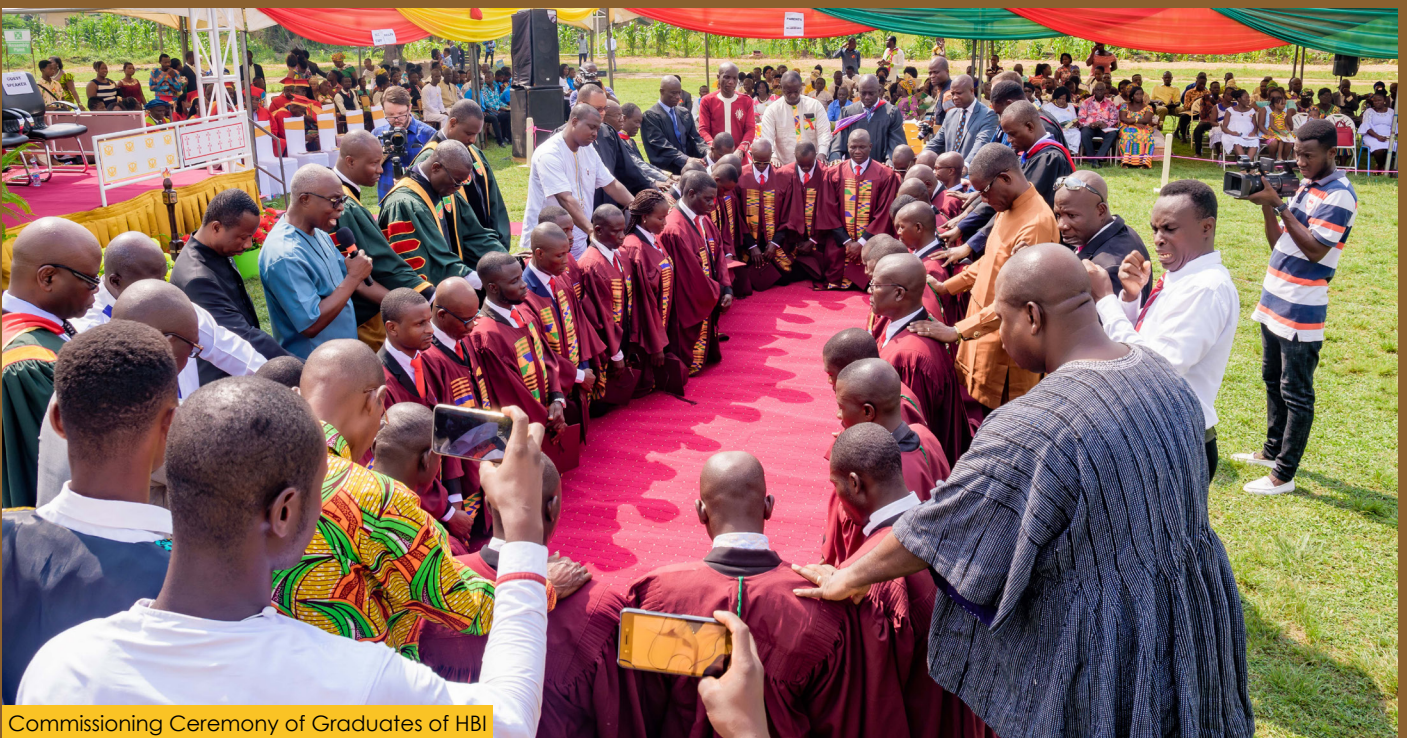
Commissioning Ceremony of Graduates of HBI