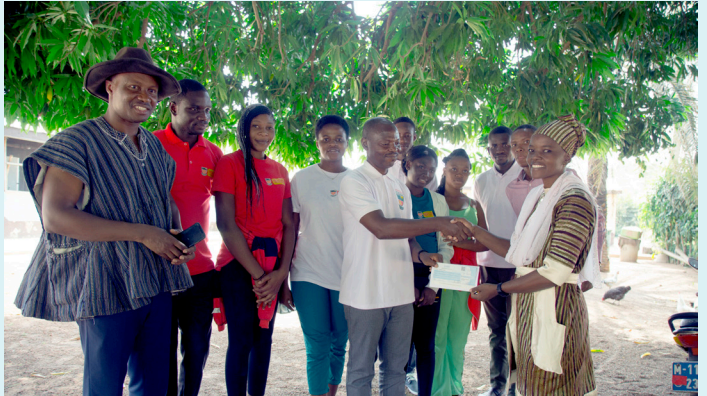
Donation at Shekinah Clinic for the Poor & Destitute