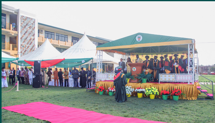
The Dais and church leaders (left)