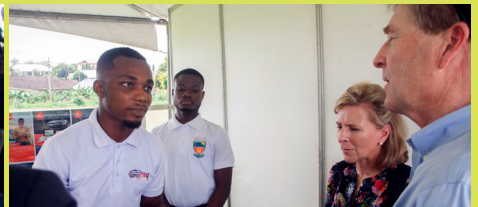
Adpextrac (vehicle tracking)