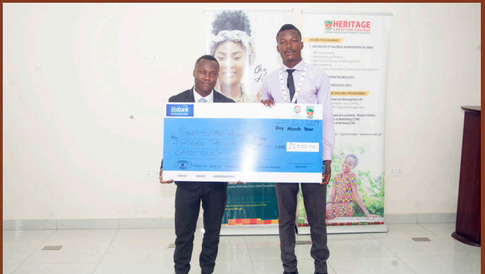
Smart Estate Agency