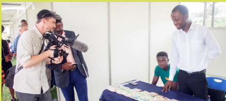
Roshmush Farms (mushroom farming)