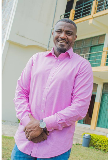
Mr. John Dumelo

"I'm happy to learn that the university is blazing the trail by offering world class Christian, entrepreneurial and technology-driven education at an affordable cost. I promise to sponsor more students to be part of the truly transformative university education HCC offers."