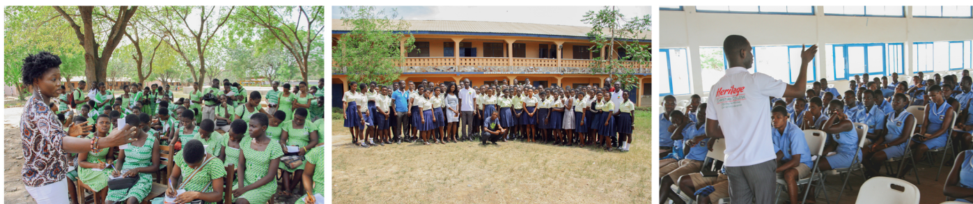
HCC mentors with some of the students

In its second edition of the Annual Heritage Career Mentorship Program, HCC staff and students toured five out of the ten regions in Ghana to inspire and guide High School final year students who were preparing to write final exams. The team went to Western, Greater Accra, Volta, Ashanti, Central regions, meeting over 5,000 students in all. Some of these students are expected to enroll into HCC during the October admission season.