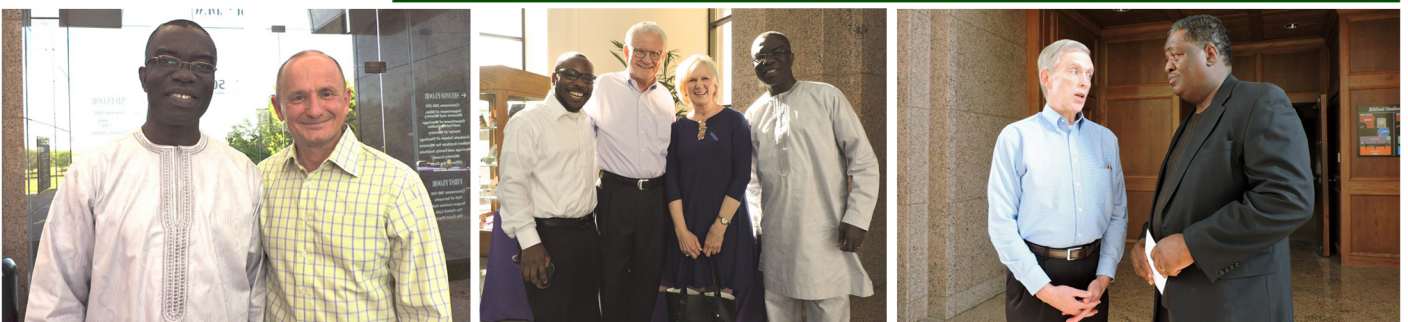
Some guests at the night