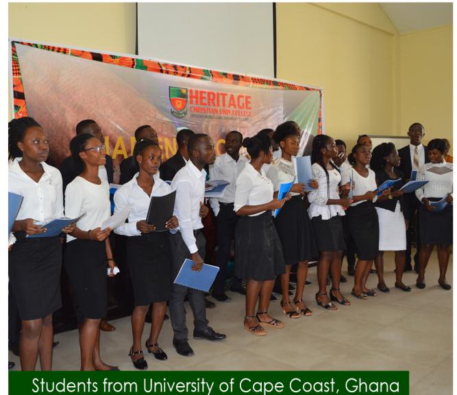
Students from University of Cape Coast, Ghana

The first session will run from 4th to 16th June, 2018. So far, 59 participants have expressed interest to participate in the maiden edition.