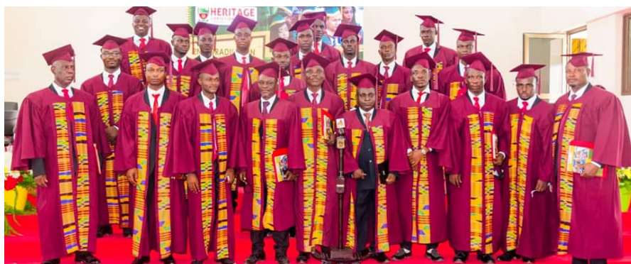
2020 HBI Graduates

'There is no doubt that Heritage Christian College and Heritage Bible Institute are transforming lives . Please join us today and become part of this fantastic work that is being accomplished under the most challenging period experienced by this institution. PLEASE PRAY, PLEASE REFLECT, PLEASE GIVE-TODAY!